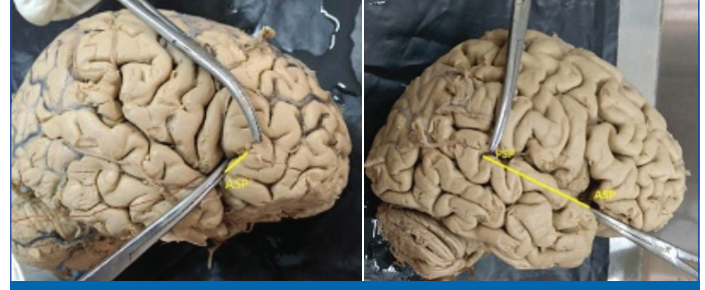
[Table/Fig-4]: Length of the anterior horizontal ramus. [Table/Fig-5]: Length of the posterior ramus. (Images from left to right) *ASP: Anterior svivian point: *PSP: Posterior svivian point

All the recorded values were entered and a data sheet was made using Microsoft excel software. The mean length of ascending ramus, horizontal ramus, posterior ramus and mean total length of left and right SF were then calculated.