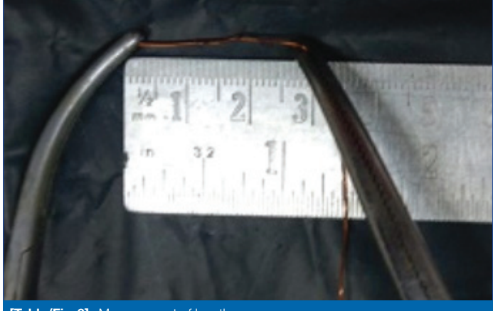
[Table/Fig-6]: Measurement of length.