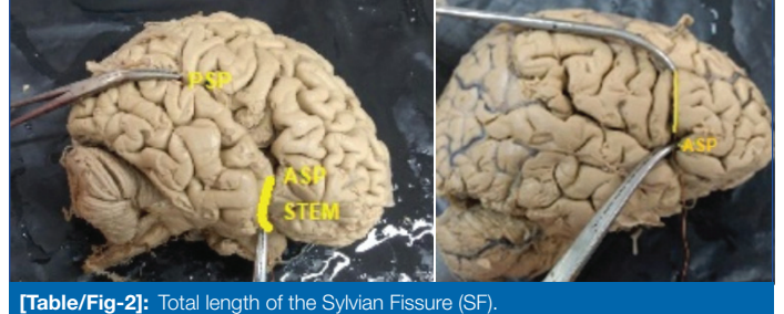
[Table/Fig-3]: Length of the anterior ascending ramus. (Images from left to right) *ASP: Anterior sylvian point: *PSP: Posterior sylvian point

The lateral sulcus was measured on the superolateral surface of the brain. The lateral sulcus was observed for its beginning, anterior sylvian point, anterior ascending, anterior horizontal, posterior limb till posterior sylvian point. All measurements were taken with the help of a thin copper wire placed on the surface, its ends being held in position with artery forceps [Table/Fig-2-5]. The wire was then placed on a graduated metal scale and the lengths of the anterior ascending, anterior horizontal, posterior rami and total length of the lateral sulcus were noted [Table/Fig-6]. Each variable was measured twice and an average of the two was noted.